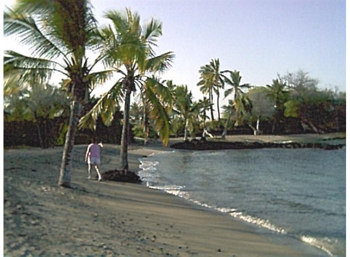
The little beach just north of Honokohau, on the Big Island.